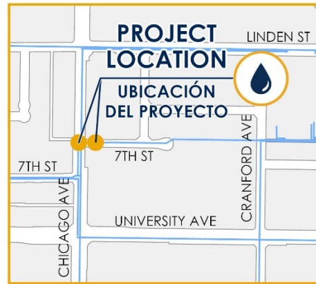
42" Valve & 48" Valve Installations at Chicago Ave & 7th St