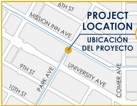
30" Valve Installation at Park Ave