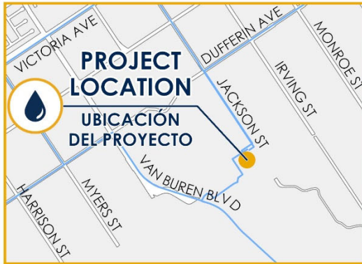
42" Valve Installation at Mockingbird Reservoir