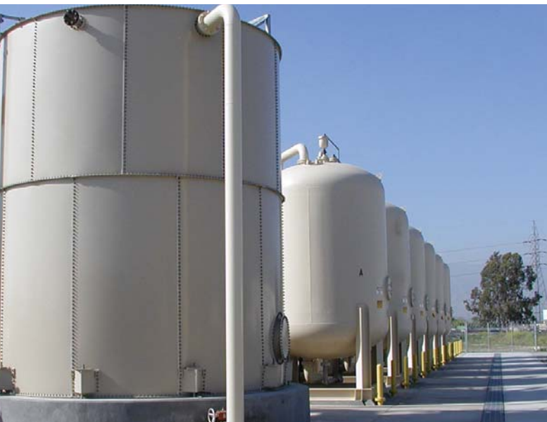
One of RPU's thirteen water treatment plants.

Our first priority is to protect Riverside's most valuable asset – groundwater, from contaminants and over drafting. Riverside, along with many other water agencies, owns substantial rights to water