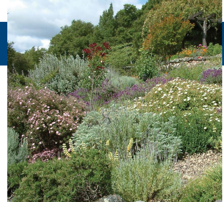
Water-wise Garden with California-friendly plants.

Water conservation programs and awareness campaigns have been in place for a number of years. Current programs offer rebates for low-flush toilets, high-efficiency clothes washers and weather-based irrigation controllers. In addition, a Water Rec-