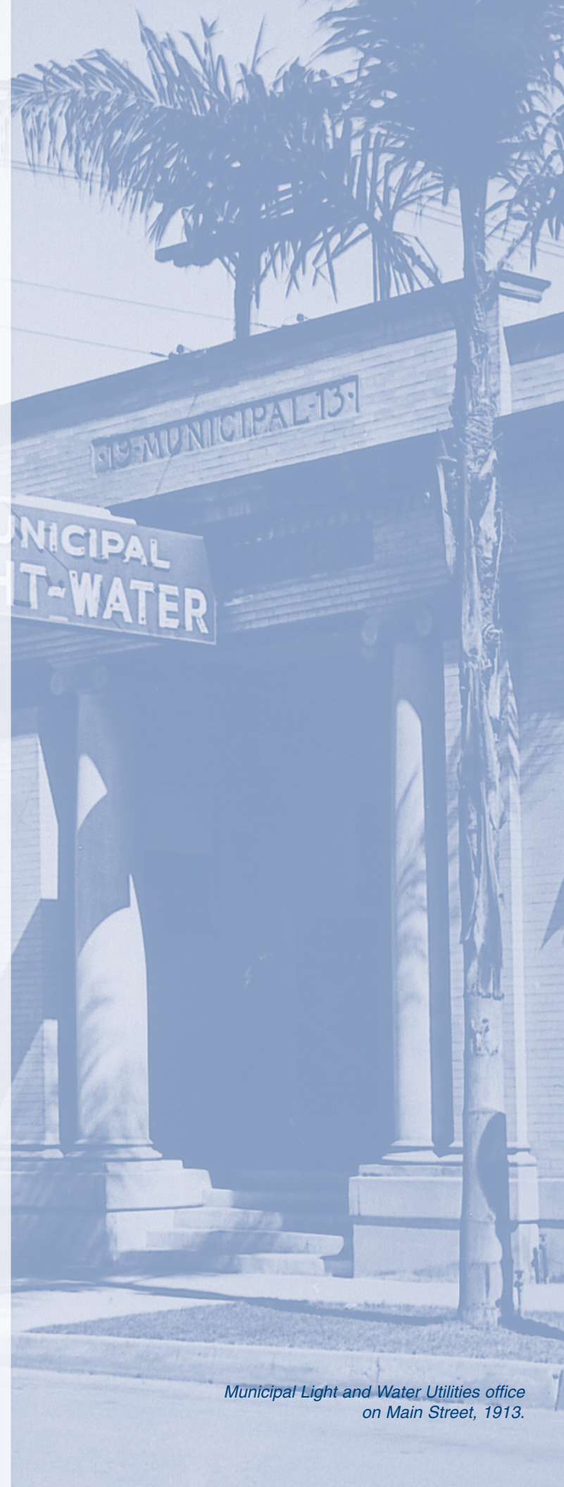
Municipal Light and Water Utilities office on Main Street, 1913.