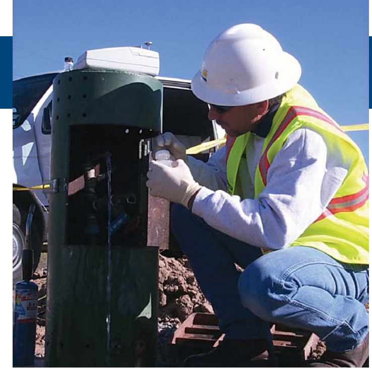
RPU Water Quality Technician testing our water.

...that the Utility operates 54 wells? The oldest wells date to the early 1900's.